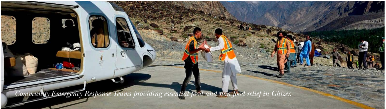
Community Emergency Response Teams providing essential food and non-food relief in Ghizer.

Pakistan has been affected by the unprecedented natural disasters triggered by the monsoon rains and intensified by Glacial Lake Outburst Floods (GLOF) causing flooding across Pakistan. Since 26 June 2025 the widespread devastation has claimed 883 lives, left 1177 injured, damaged infrastructure including 9261 houses, 239 bridges, and 671 km of roads. More than 6180 livestock have perished. Millions of people have been displaced, and thousands of villages have been submerged, placing immense pressure on food security, health systems, and livelihoods. The affected communities are in urgent need of support.