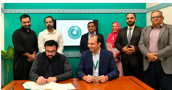
Signing of the MoU between AKU-EB and PMU-School Education Department, Government of Balochistan.