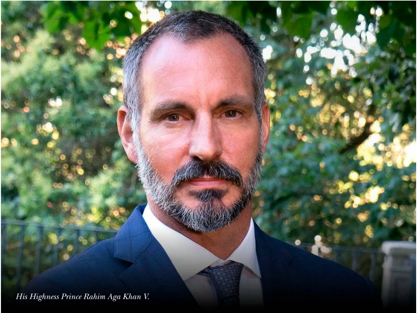
His Highness Prince Rahim Aga Khan V.

His Highness Prince Rahim Aga Khan V succeeded his father the late Aga Khan IV Shah Karim Al Hussaini in accordance with historical Shia Imami Ismaili tradition on 4 February 2025 upon his passing. In that capacity, he has assumed the role of Chair of the Aga Khan Development Network. His Highness was educated at Phillips Academy Andover and graduated in 1995 from Brown University with a Bachelor of Arts in Comparative Literature.