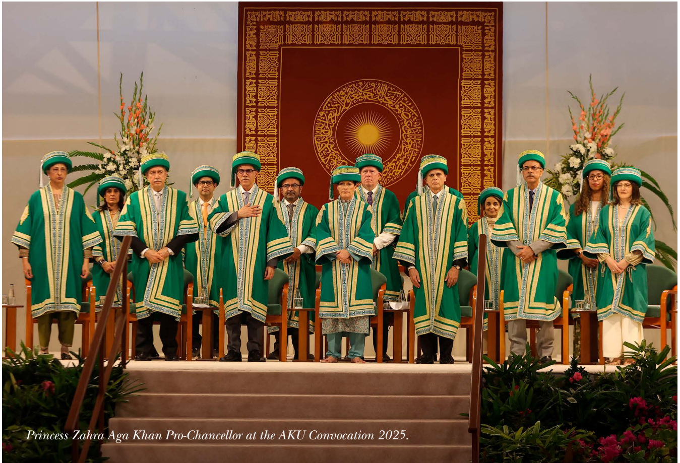
Princess Zahra Aga Khan Pro-Chancellor at the AKU Convocation 2025.

The Aga Khan University in Pakistan celebrated a landmark Convocation this year, honouring its founding Chancellor, His Late Highness Prince Karim Aga Khan IV. The ceremony, attended by Princess Zahra Aga Khan, marked a historic transition as AKU welcomed His Highness Prince Rahim Aga Khan V as its new Chancellor and Princess Zahra as its Pro-Chancellor. A total of 473 graduates—more than 70 percent of whom are women—earned bachelor's, master's, and doctoral degrees in 16 different fields in nursing, medicine and education. To date, AKU has awarded nearly 16,000 degrees, diplomas and postgraduate certificates in Pakistan.