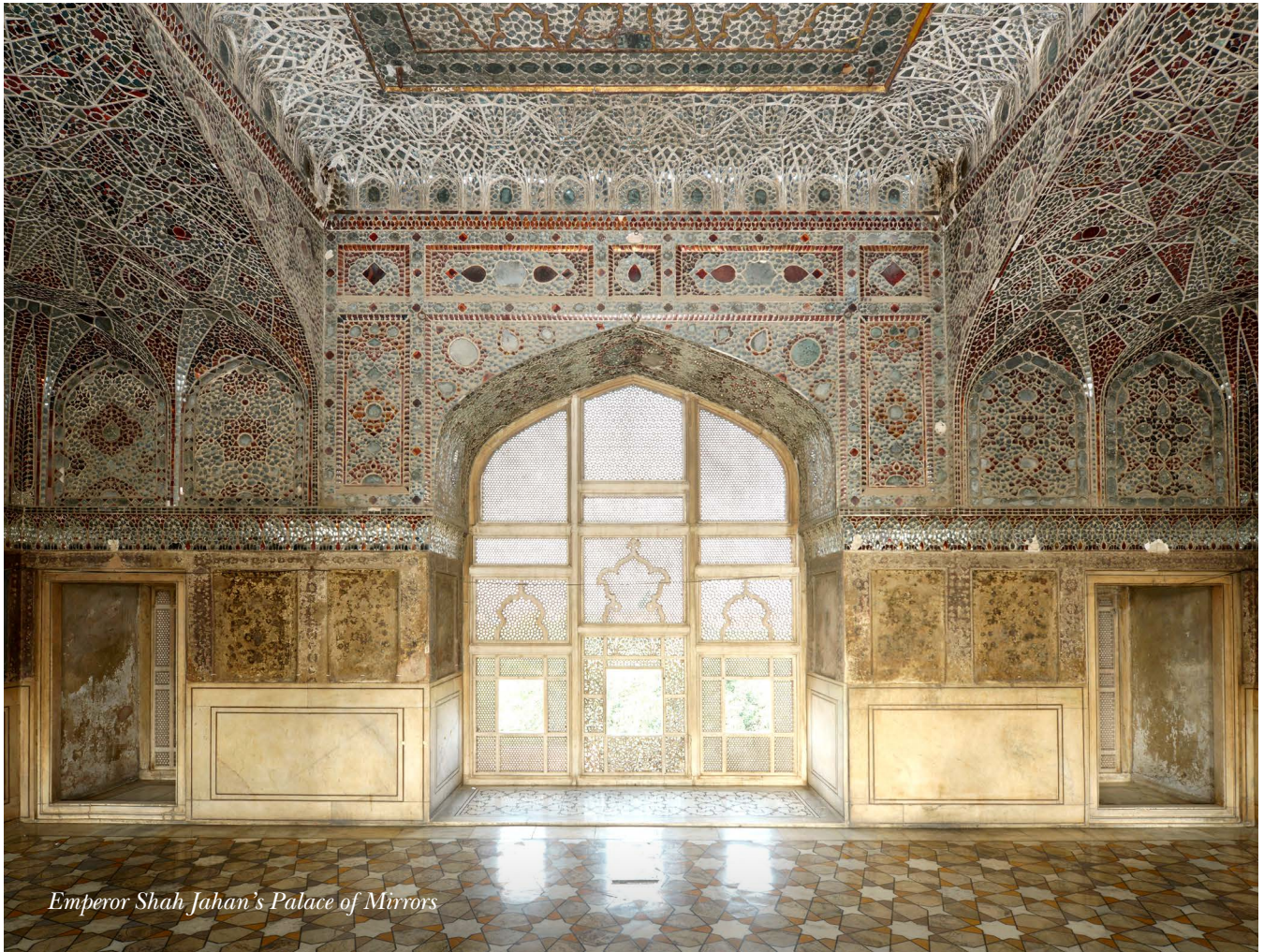
Emperor Shah Jahan's Palace of Mirrors

The Sheesh Mahal, also known as the “Palace of Mirrors”, dates to the 17th century, during the reign of Emperor Shah Jahan. The palace, considered one of the highlights of the Lahore Fort, features intricate floral and geometrical patterns and semi-precious stones inlaid in white marble columns (Pietra dura work). Meanwhile, convex glass mosaic work, delicate stucco tracery, and the stucco's gilded ornamentation further add to the structure's glory.