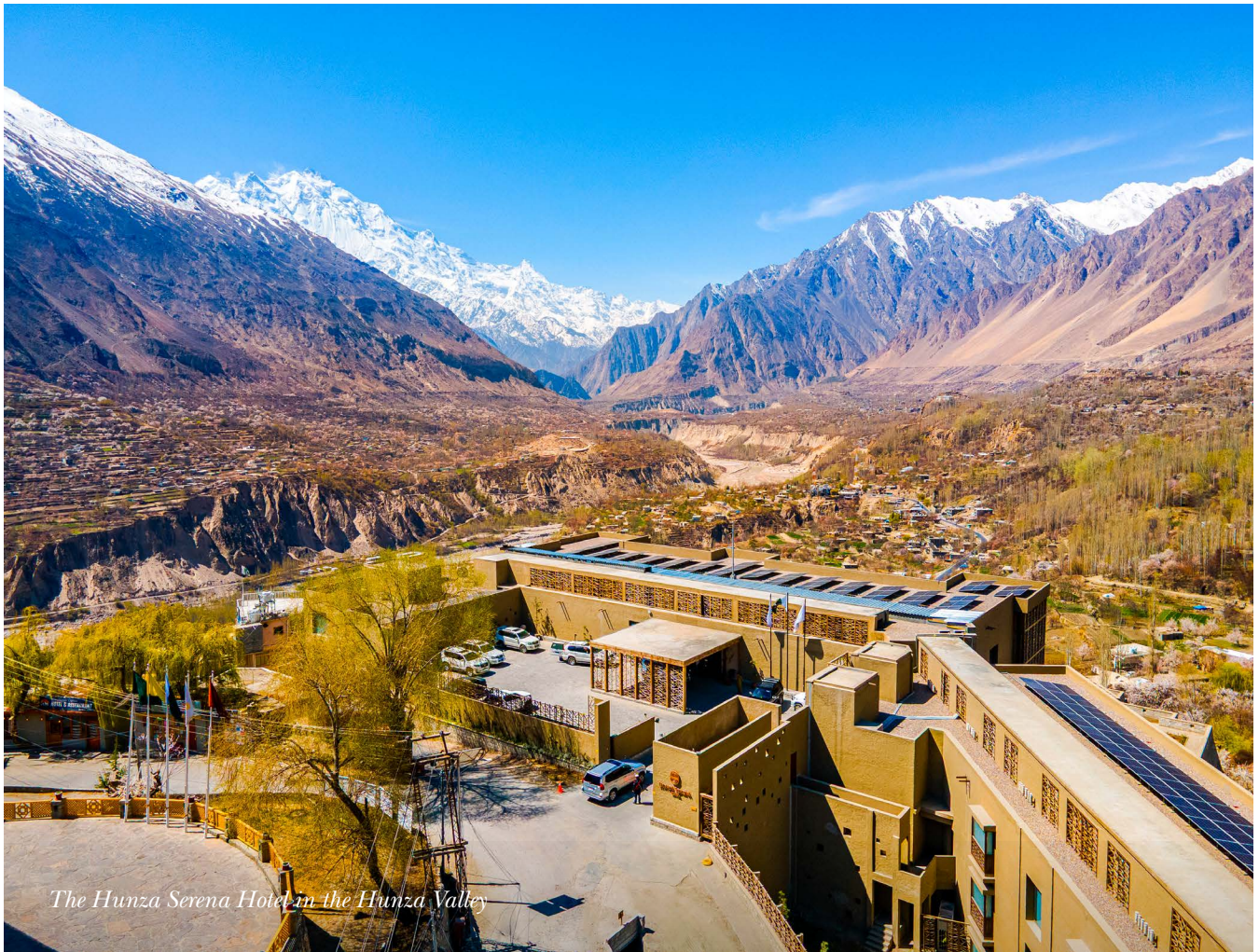
The Hunza Serena Hotel in the Hunza Valley

Situated in the breathtaking Hunza Valley, Hunza Serena Hotel redefines eco-friendly hospitality by blending comfort with a deep commitment to sustainability. Every detail of the property has been thoughtfully curated to reduce its environmental footprint while offering guests a responsible and memorable experience. This commitment starts with the 'IFC - Excellence in Design for Greater Efficiencies' (EDGE) green-building certification, affirming that modern comfort can coexist with environmental responsibility. At Hunza Serena Hotel, extensive solar power leverages the valley's abundant sunlight to reduce our carbon footprint and promote renewable energy.