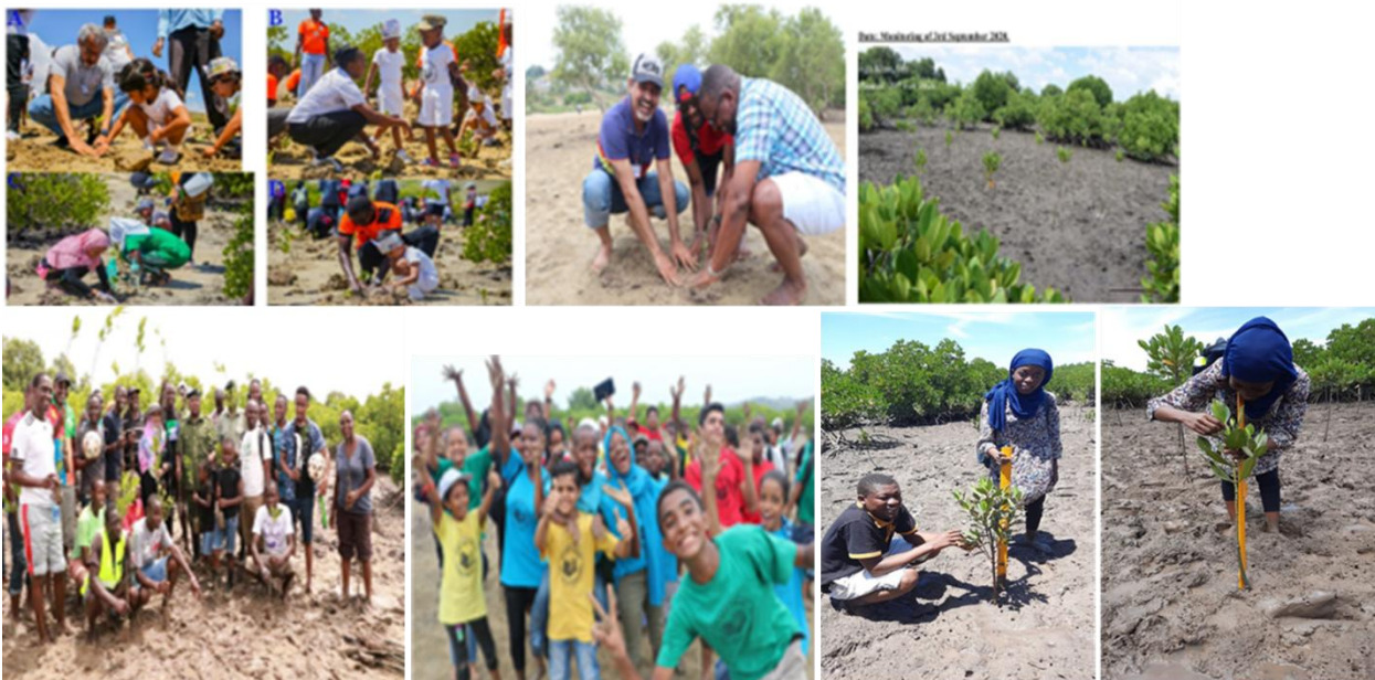
Tree planting and growth monitoring activities