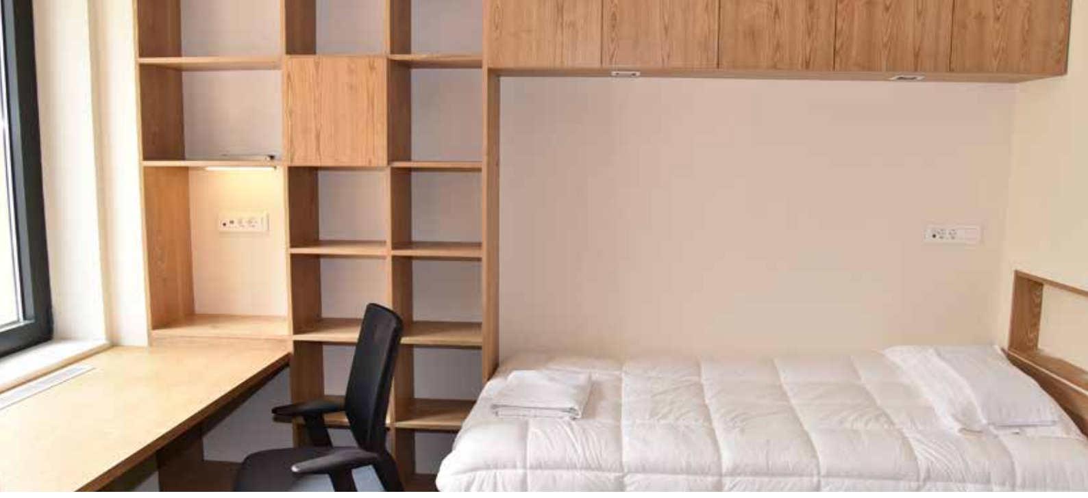
Spacious dormitory rooms that can be configured for privacy with attached bathroom and shower facilities.