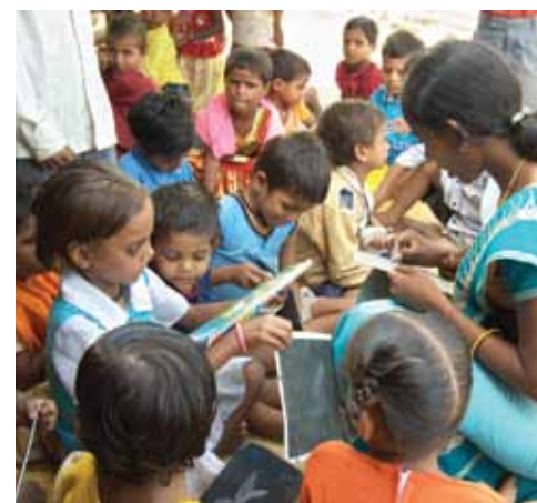
ABOVE: In Bihar, India, AKF supports community-managed learning spaces and provides teacher training and curricula input that helps to make classroom learning relevant to children's daily lives.

Central to AKF's efforts have been inclusive, community-based development approaches , whereby local organisations identify, prioritise and implement projects with AKF's assistance. Once community organisations have started providing services, AKF expands the programme through establishing village organisations elsewhere. AKF then