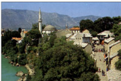
Mostar Old Town, Mostar, Yugoslavia.