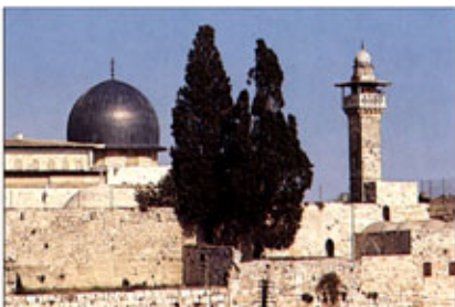
Al-Aqsa Mosque, al-Haram al-Sharif, Jerusalem.