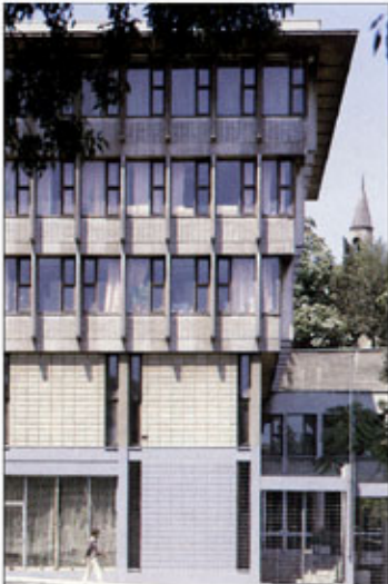
The Social Security Complex, Istanbul, Turkey.