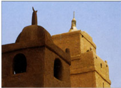
Yaama Mosque, Yaama, Niger.

HISTORIC SITES DEVELOPMENT • page 188 ISTANBUL, TURKEY