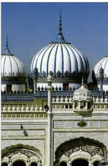
Bhong Mosque, Bhong, Pakistan.