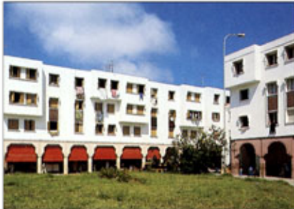
Dar Lamane Housing Community, Casablanca, Morocco.