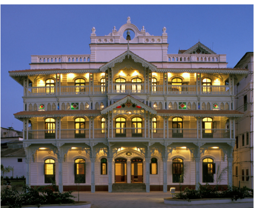
The Old Dispensary, constructed in 1894, was restored by AKTC in 1997.

The Aga Khan Trust for Culture, the cultural agency of AKDN, works in concert with other AKDN agencies to bring a variety of activities and disciplines to bear in order to stimulate positive change that leads to the overall quality of life.