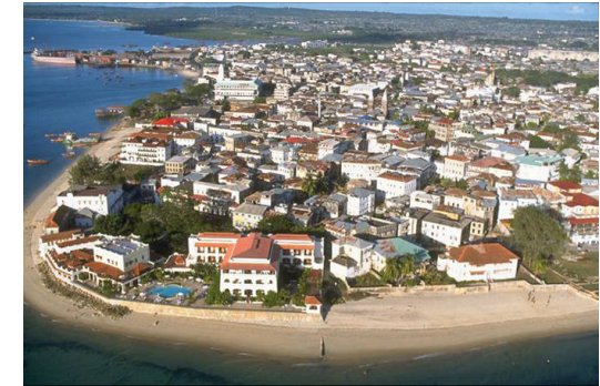
The Zanzibar Serena Inn was the result of the conversion and restoration of two historic seafront buildings.