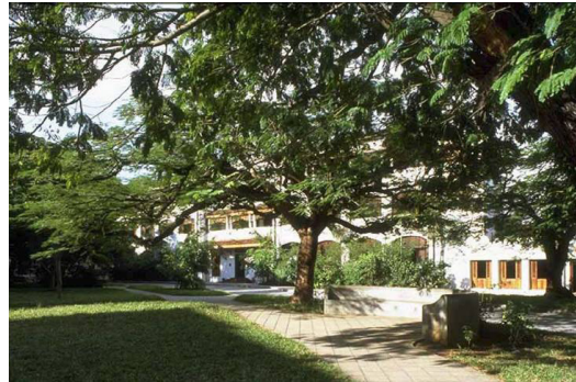
Kelele Square, after transformation, is part of a larger improvement and rehabilitation programme in Stone Town.

The Aga Khan Trust for Culture (AKTC) has been active in Zanzibar since 1989, successfully completing the restoration of the Old Dispensary and the Old Customs House, upgrading of housing, as well as the rehabilitation of Kelele Square. Inspired by His Highness the Aga Khan's commitment to the preservation of historic cities in the Muslim world, AKTC has been working in places such as Cairo, Delhi and Kabul to restore and rehabilitate public spaces and historic buildings proving that public spaces can be self-sustaining and become catalysts for economic and social development and overall positive change.