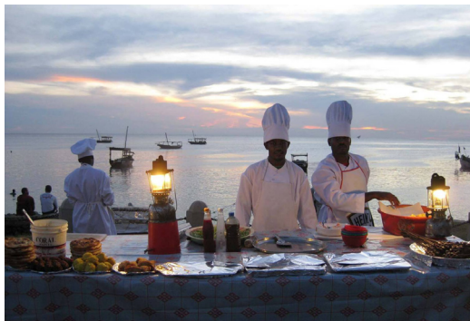
Forodhani Park revitalisation included the upgrading of vendors' area and equipment as well as training on sanitation, hygiene and service.