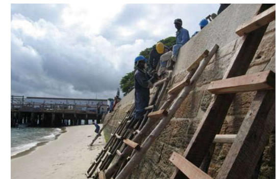
The restoration of the seawall in front of Forodhani Park was a major part of the project, which also included the training of local masons.

Zanzibar Serena Inn Kelele Square Forodhani Park Seafront Rehabilitation Project Old Customs House Old Dispensary