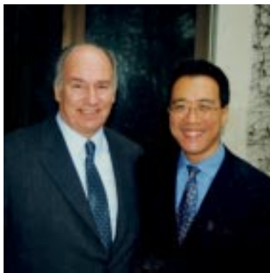
His Highness the Aga Khan and Yo-Yo Ma

From the beginning of his involvement in the Silk Road Project, the Aga Khan has insisted that resources — in the form of cultural exchanges, educational activities and scholar exchanges — directly serve the communities in the Silk Road countries. The purpose of this approach is to ensure that resources and expertise contribute to the creation of autonomous institutions maintained and sustained by the local communities.