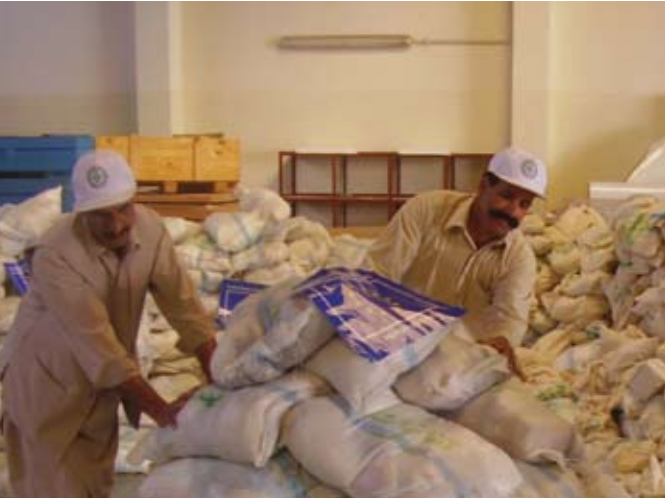
FOCUS volunteers around the world play a vital role in organising emergency supplies to be collected, individually packed, loaded onto donkeys, helicopters, lorries, or boats for safe delivery to communities in need

An integral strength to FOCUS is its international volunteer network. This dedicated human resource can be mobilised to assist FOCUS crisis response operations especially at short notice.