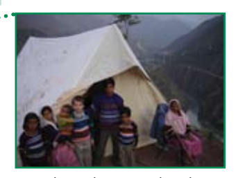
In Indian-administered Kashmir, emergency supplies were delivered to isolated villages after the South Asia earthquake