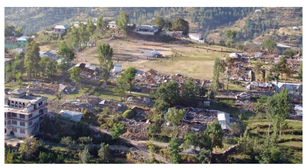
The South Asia earthquake in 2005 devastated the mountainous city of Balakot in Pakistan-administered Kashmir

World communications beam instantly around the globe the image of death and misery—of earthquakes, tsunami, plague, and of man-made disaster of violence and hatred. For a time, they capture the world's attention and generosity. Governments, themselves overwhelmed, do their best and carry most of the burden of the basic recovery. But they and the world's donors must very often look to existing, specialised, non governmental organisations that have the knowledge, professional manpower and experience to respond to the great array of ills that follow social trauma.