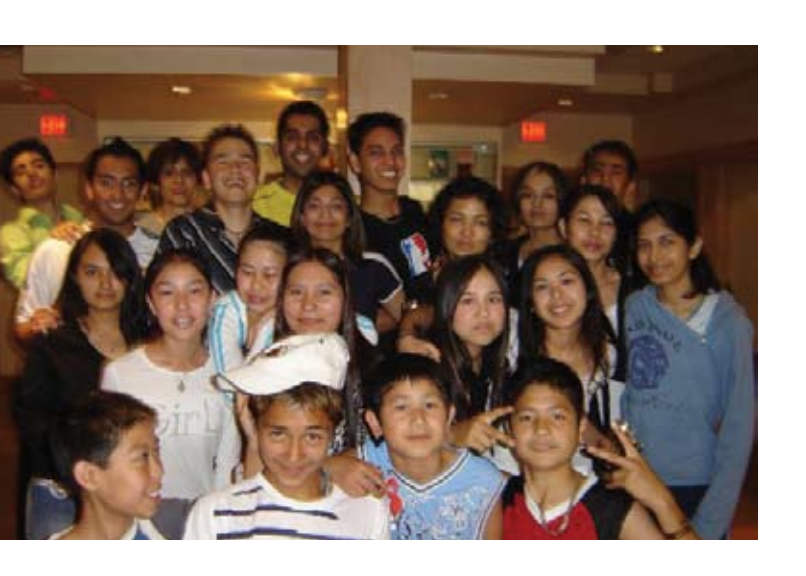
Youth from Afghanistan, newly-arrived in Quebec, Canada look to the future with a renewed sense of hope and opportunity

Since 1994, FOCUS has sought to assist people affected by displacement. Following serious civil conflict in countries such as Afghanistan, Tajikistan, and Kosovo, FOCUS facilitated the relocation of communities to Canada, Germany, India, Pakistan and Russia.