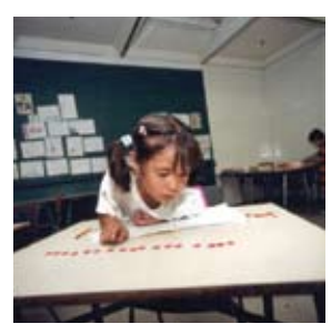
Young children and adults actively engaged in education and re-training

Programmes have included components to assist with cultural acclimatisation, such as language classes, vocational training courses for men and women as well as education development and local community orientation. Such programmes are often facilitated with formal partnerships, such as the protocols of agreement signed by the Quebec government in Canada between 1992 and 2001 to assist the resettlement of over 1,600 Afghan refugees in the province of Quebec.