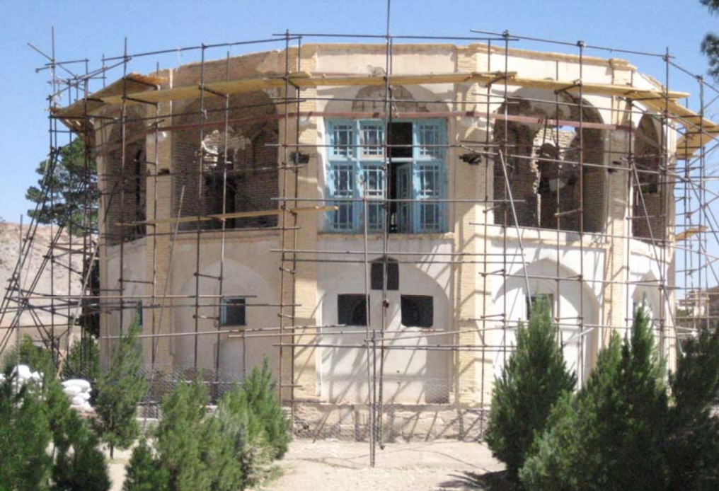
The Namakdan once stood at the centre of a formal Persian garden