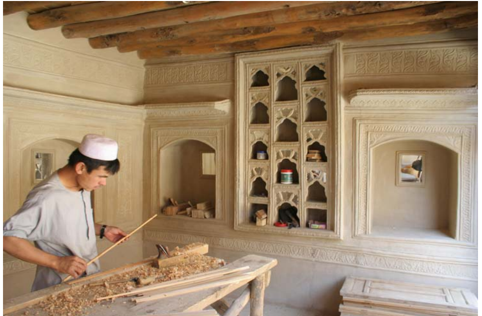
The courtyard of the house served for 2 years as AKTC's joinery workshop, in which 20 apprentices were trained.

Even in its partially-collapsed state during surveys in 2004, Haji Ruhullah's house stood out from the surrounding fabric, with its large courtyard and decorated timber screens – some of which retain their original coloured glass – and fine internal plasterwork. Like many other merchant houses in the old city, most of which have disappeared, the dozen or so rooms of Rohullah's house were built in different times, and show the evolution of decorative styles over the past 70 years or more. The grandfather of the present owner, who might have been the original builder, served as an imam in Nader Shah's court, and is said to have commuted from the old city to the Arq by elephant. The distinction of the owners of the house is further borne out by the domed hammam , or bathroom – complete with ingenious system of water supply. Rohullah recalls weekly family bath days in this tiny space. Animals too were an important part of the life in the house, for Haji's father kept two horses in the basement, and raced a flock of pigeons from the roof.