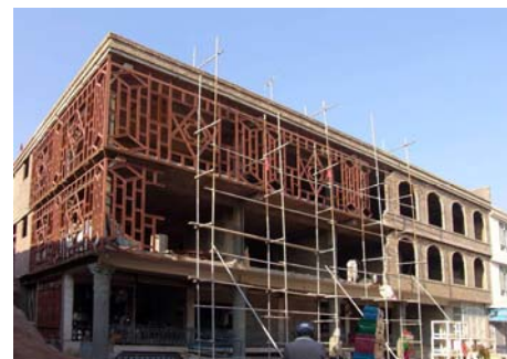
Improving facade design

The illegal demolition of shops close to Darwaza Malik, the northern entrance to the walled city, has further altered what remains of the historic fabric of Herat. Having built a large commercial building (which bears little resemblance to the scheme approved by local planners), the developer defied the instructions of the Old City Commission to retain the existing street frontage, which was demolished overnight at the end of May.