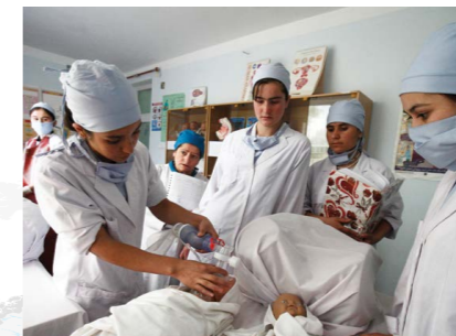
HEALTH CARE: To reduce the high incidence of preventable deaths during childbirth in Afghanistan, AKDN has trained over 400 midwives in the country, about 10 percent of the total.