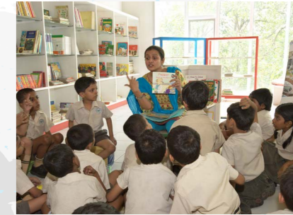
EDUCATION: The Diamond Jubilee School in Mumbai, India, established in 1947, is today part of a network of 200 quality Pre-K to 12 schools operated by AKDN. These schools have a total annual enrolment of 73,000.