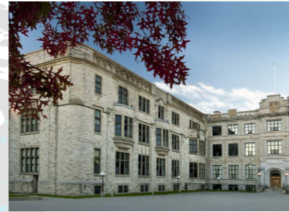
PLURALISM: Institutions such as the Global Centre for Pluralism (GCP) in Ottawa, Canada, established in 2006, help bridge and heal divisions across different faiths and between developed and developing countries.

Although weighing ceremonies are not part of the current Aga Khan's Jubilee celebrations, many of the institutions created under the Aga Khan Development Network (AKDN) and its institutional predecessors over the last 100 years were jubilee projects: schools, clinics and hospitals, electricity generating plants, companies offering essential goods and services, early childhood programmes that give poor children a head start, hotels that set standards for environmental stewardship, an architectural award that has influenced architectural discourse for four decades, universities and