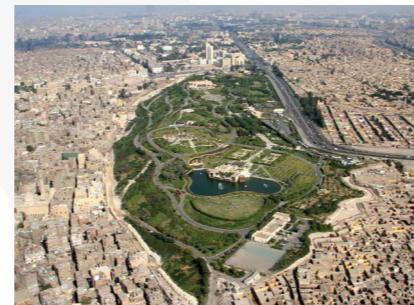
CULTURE: The AKDN integrates cultural development into many of its projects. The various city parks and gardens it has built, such as Al-Azhar Park in Cairo, Egypt, provide tens of millions of urban dwellers with oases of green space.