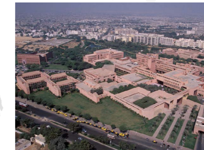
RESEARCH: The Aga Khan University (AKU), which has campuses in Pakistan and East Africa, is one of the developing world's leading sources of health and education research, creating new knowledge with the potential to save and enhance millions of lives.