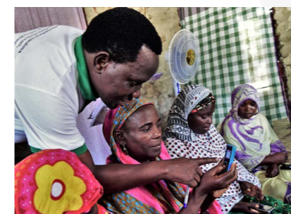
FINANCIAL SERVICES: In some of Tanzania's poorest provinces, the Network is providing the rural poor a safe and inexpensive way to save money through digital savings groups.